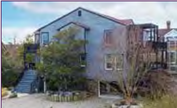
204 Massachusetts Avenue $1,495,000