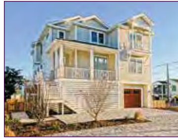
101 Cedar Street • $2,145,000