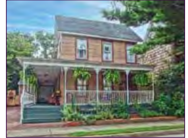
437 Kings Highway • $790,000