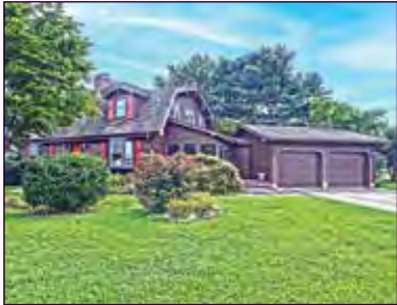
6 Inlet Place • $599,900