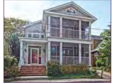
134 Jefferson Avenue • $1,100,000