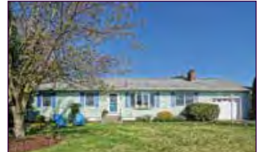
34079 Beech Drive Sandy Brae $399,900