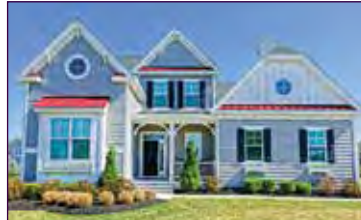
30823 Stallion Lane $1,399,000