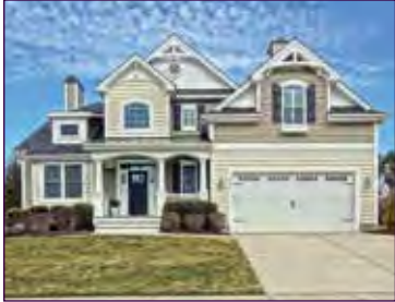
32667 Hastings Drive • $1,005,000