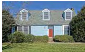
8 Harborview Road $599,900