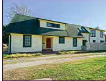
104 Orr Street • $995,000