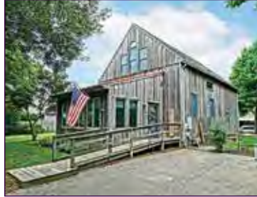
22 Shipcarpenter Square • $1,350,000