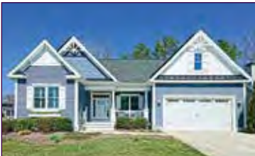
16045 Rockport Drive $829,900