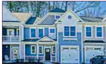
12411 Dickinson Court $689,900