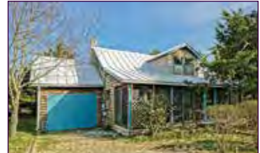
109 W. Canal Street $995,000