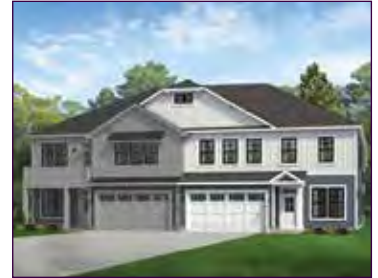
17229 Brinleighs Way • $669,660