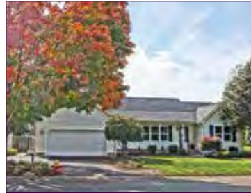
7 Sandpiper Drive • $595,000