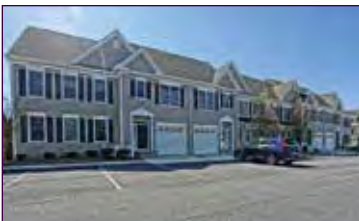
18813 Bethpage Drive $449,900