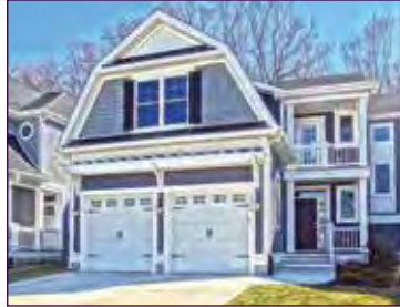
12210 Collins Road • $995,000