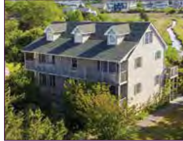
206 Massachusetts Avenue • $1,200,000