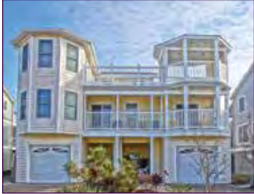
528 E. Cape Shores Drive • $1,350,000