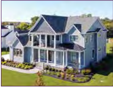
16128 Derby Drive • $1,900,000