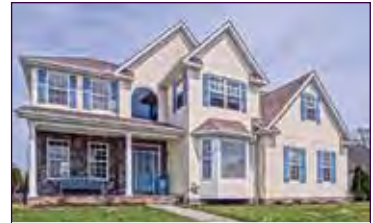
33487 W. Hunters Run Villages of 5 Points East $759,900