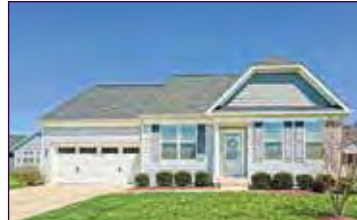
12161 Spicer Creek Avenue Villages at Red Mill Pond $479,900