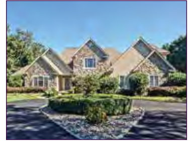
16189 Gills Neck Road • $1,625,000