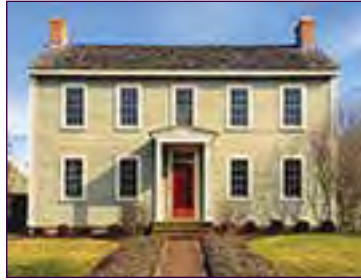
42 Shipcarpenter Square • $1,850,000