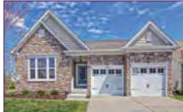
31843 Carneros Avenue Nassau Grove $614,900