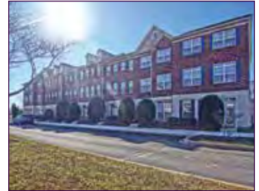
7218 N. Village Main Blvd. • $550,000