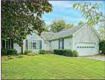
9 Brownson Court • $720,500