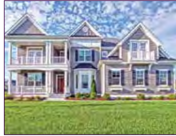
18393 Show Jumper Lane • $1,695,000