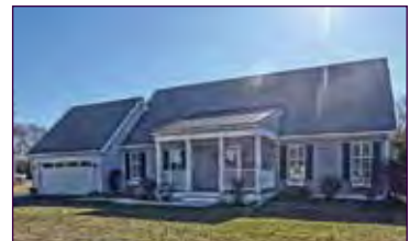
34 Tradewinds Lane $499,900