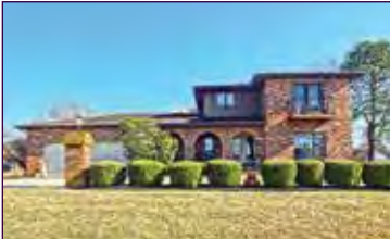
30750 Edgewater Drive Edgewater Estates $699,900