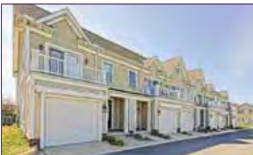
19216 Farros Alley $519,900