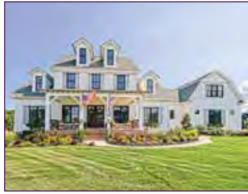
30811 Stallion Lane • $2,200,000