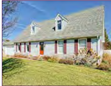
106 Dove Drive • $595,000