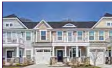
33720 Freeport Drive $519,900