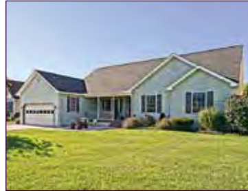
402 Ocean View Blvd. • $710,000