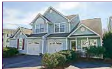
17256 Queen Anne Way $419,900