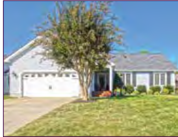
230 Ocean View Boulevard • $715,000