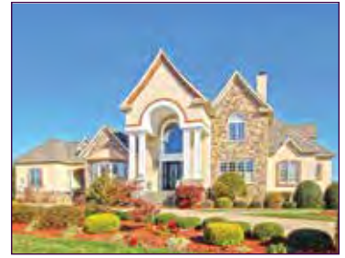
35765 Black Marlin Drive • $1,900,000