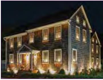
302 Mulberry Street • $2,215,000