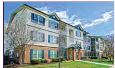
17063 S. Brandt Street #4303 $299,900