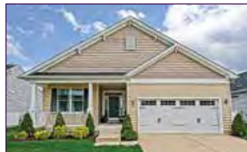
34148 Spring Brook Avenue $499,900