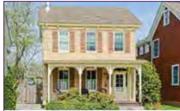
116 Mullberry Street Downtown Lewes $1,500,000