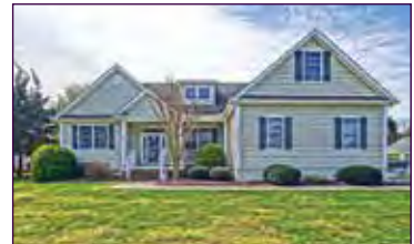
31056 Edgewater Drive $595,000