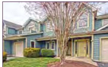
16 Pondview Lane $350,000