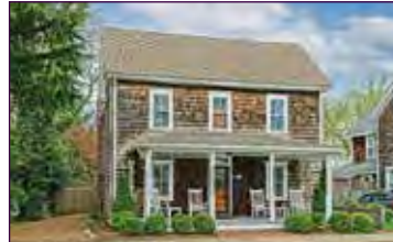
138 Kings Highway $1,295,000