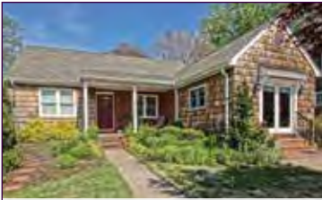
108 Shipcarpenter Square Downtown Lewes $1,595,000