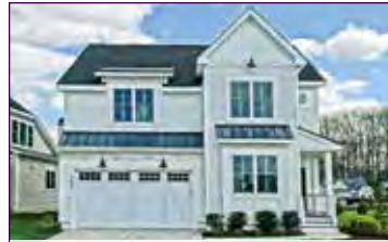
11808 Haslet Road Governors $1,049,000